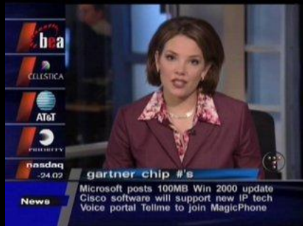
Bernie: Yes, with my new program, you could be fighting evil with girls like Erica...