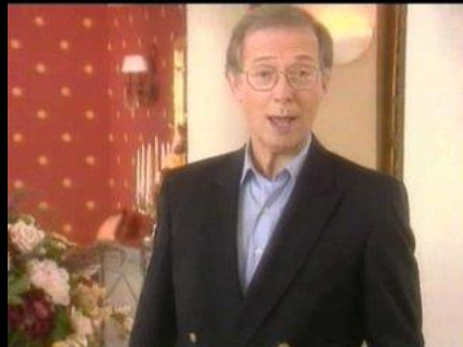
Bernie: Hi, I'm Bernie Kopell. You might remember me from such TV hits as "Get Smart," "The Love Boat" and "The Lancelot Link Secret Chimp Hour."