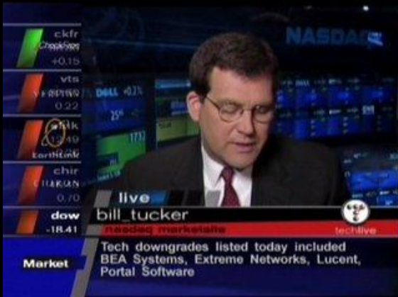
Bill: Back to you, Erica.