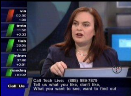
Voice Over: Heroes have risen...