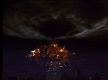
Voice Over: It was a time of fire...