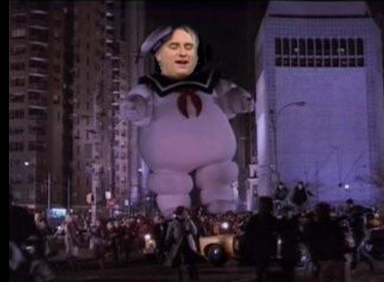
Voice Over: The legions of darkness, led by the giant marshmallow Leo, have taken the west coast...