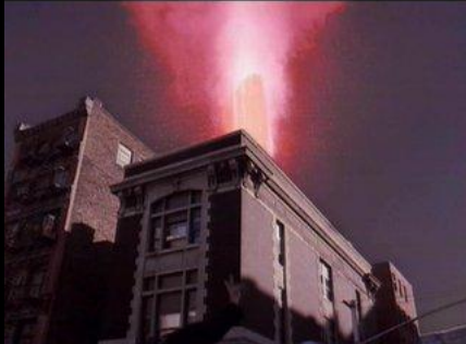
Voice Over: It was a time of chaos...