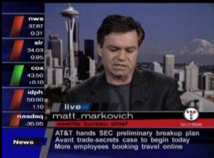
Voice Over: Heroes have fallen...