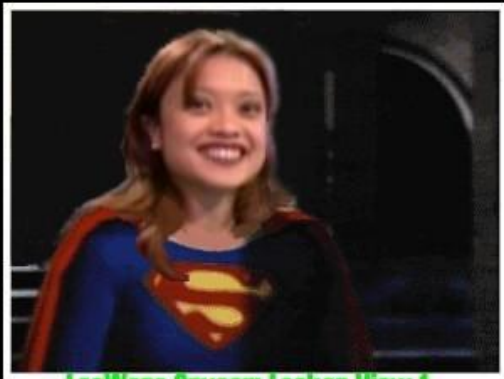
LeoWare Spycam Locker View 1