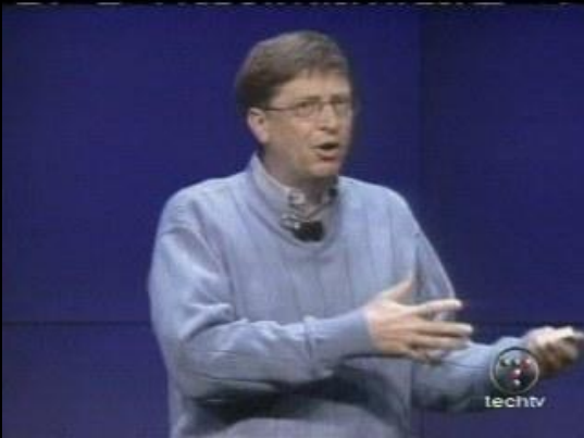
Bill Gates: A world of never ending happiness ... you can always see the sun, day or night ...