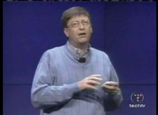
Bill Gates: In this life ... you're on your own! And if the elevator tries to bring you down, go crazy ... punch a higher floor!