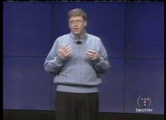
Bill Gates: So when you call up that shrink in Beverly Hills -- You know the one -- Dr. Everything'll be alright ..