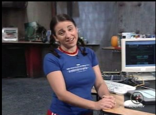
Schmegan: No! No! Alls bad we's do! Not good, bads takes the precious in the end!