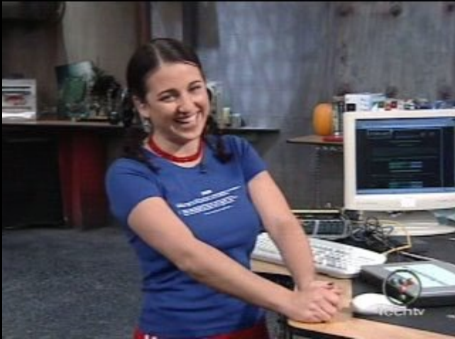
Megan: We's shall do what we's try to do every night, Schmegan!