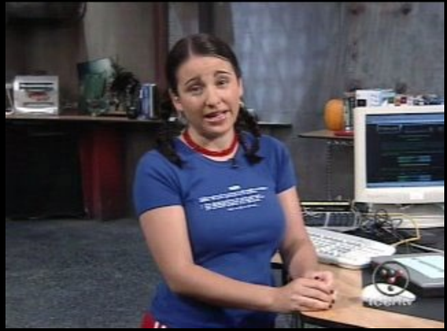
Schmegan: No we's cant! What we's do?