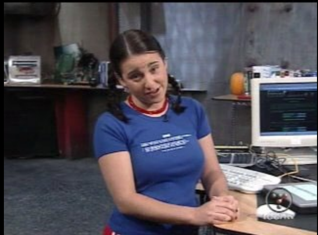
Schmegan: But Megan, TechTVs is we's friends! No want to hurt the TechTVs they no hurt we's!