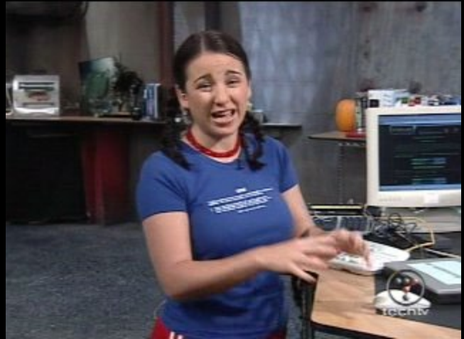
Schmegan: Dress up like Trinity and dreams about kicking Leo's flabby goat-loving butt?