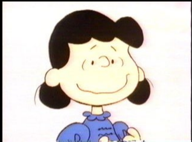
Lucy: Charlie Brown was under my psychiatric care. Of all my patients, he was the Charlie Browniest. It wouldn't surprise me if that blockhead finally did himself in this time. Hey, can you get me a gig on "American Idol?"