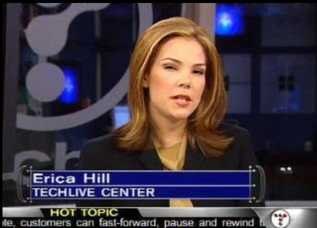
Erica: While authorities aren't ruling out foul play; the list of suspects who were annoyed by and wanted to kill the former child star are endless. Turning to domestic news ...