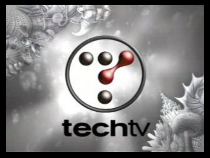
Hold onto your seats! We'll be back!

HOME About buog comment previous next most images (c) 2004 techtu. strips (c) 2004 James knine. Forum hosted by Amazing Forums.com