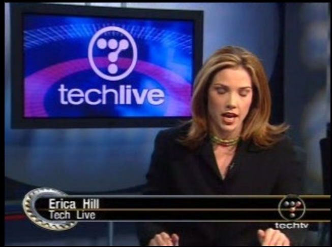
Erica: So let's look at what led up to this big showdown.