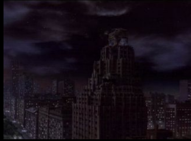
Microsoft Bob: Holy banana splits -- I would trade eight camels and my autographed copy of "Po Leo Yo Guide to Spokespersoning Like You Know What You're