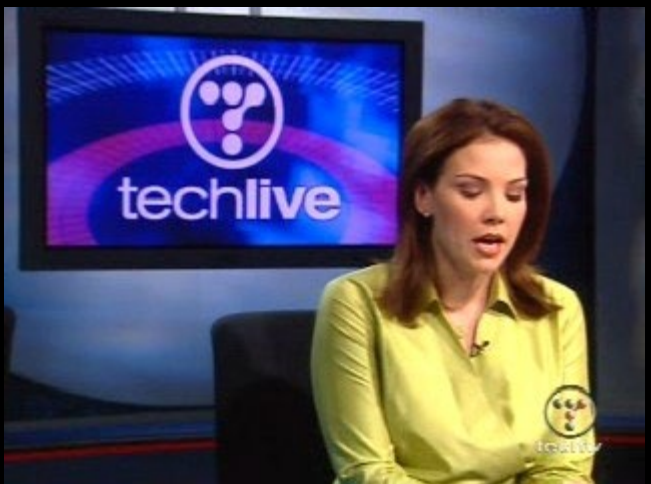
Erica: Then can you read to me the screen behind you and explain the picture that goes with it please?