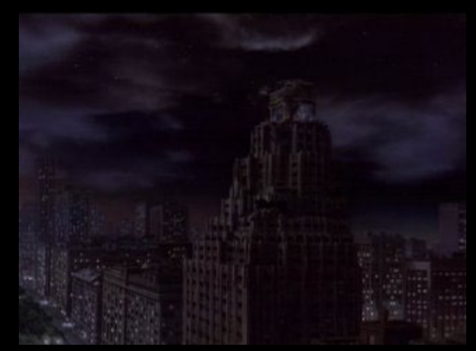
Microsoft Bob: There was no hacking. No hacking here! Buy our server in large volumes, indeed! You all should trust Microsoft!