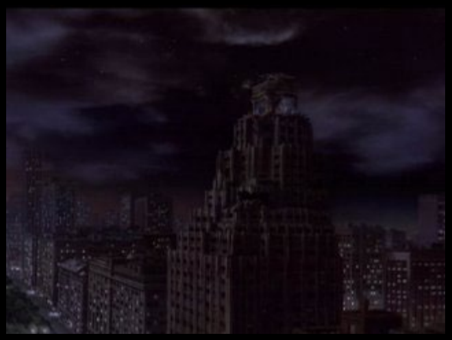
Microsoft Bob: Here is the "Riiiiiiight" again, what does it mean, my beauty?

Doing 2002" for one night with you, my beauty!