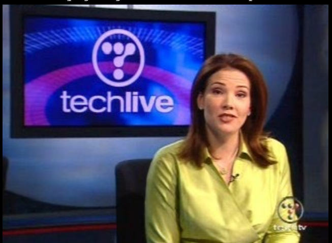
Erica: Riiiiiiiight. So sir, you're sure that the servers are working properly?