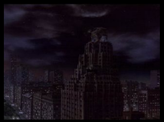
Microsoft Bob: Yes, yes, there was a problem with the display, the computers weren't running our software, our lead programmer dropped acid and freaked out. He hijacked a busload of penguins. So it's sort of a Microsoft family crisis. Bye!