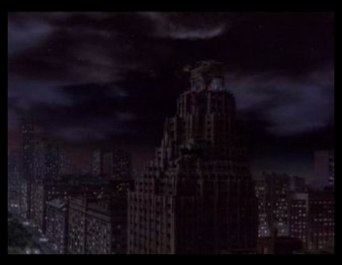
Microsoft Bob: No hacking, that was just a clerical error. All the screens are fixed!