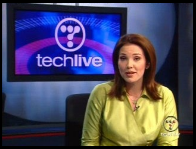
Erica: So they're all fixed now?