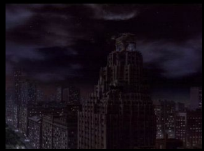
Microsoft Bob: No hack here! No hack here! We had are spirits in the material world! Yah, spirits in the material world!