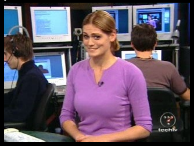
Morgan: Family? You mean that we're like sisters?