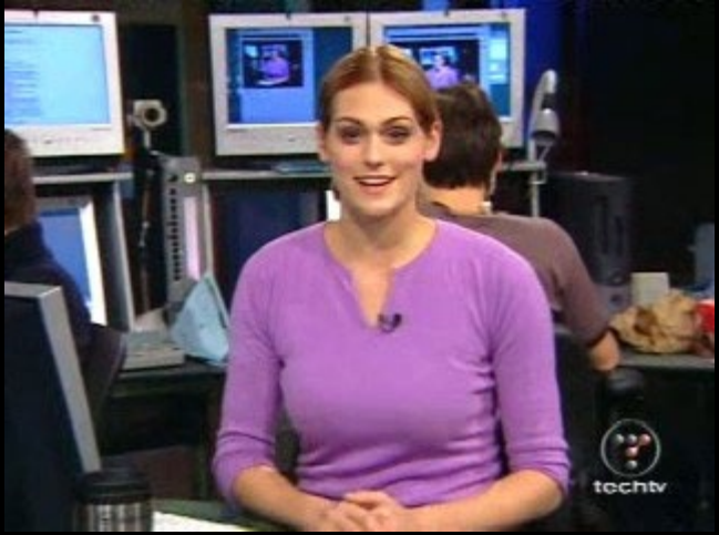
Morgan: This isn't about \dots the incident is it?