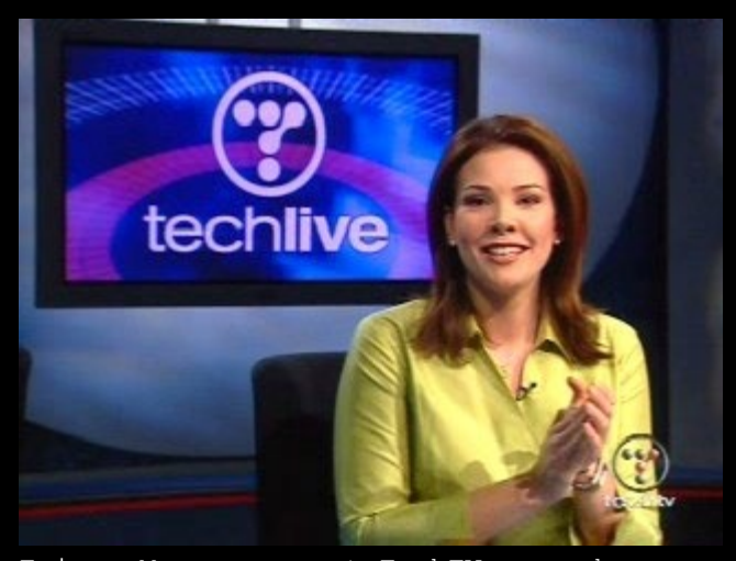
Erica: Morgan, we at TechTV -- and our 30,000 viewers -- are a big family! I promise whatever you say will not go out of our little family here!