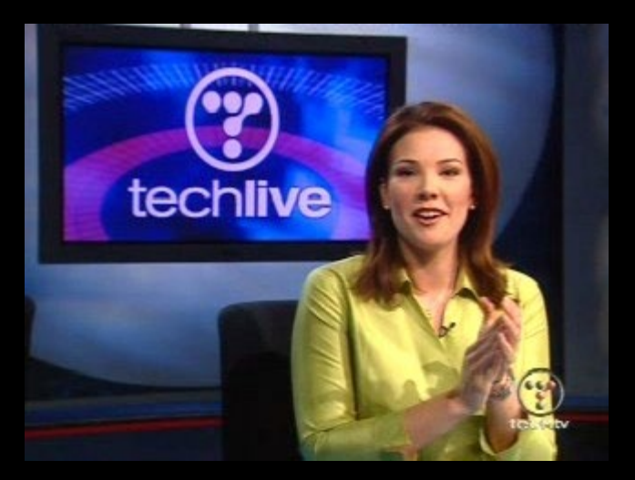
Erica: Oh, I smell a juicy rumor here! Fill me in girlfriend!