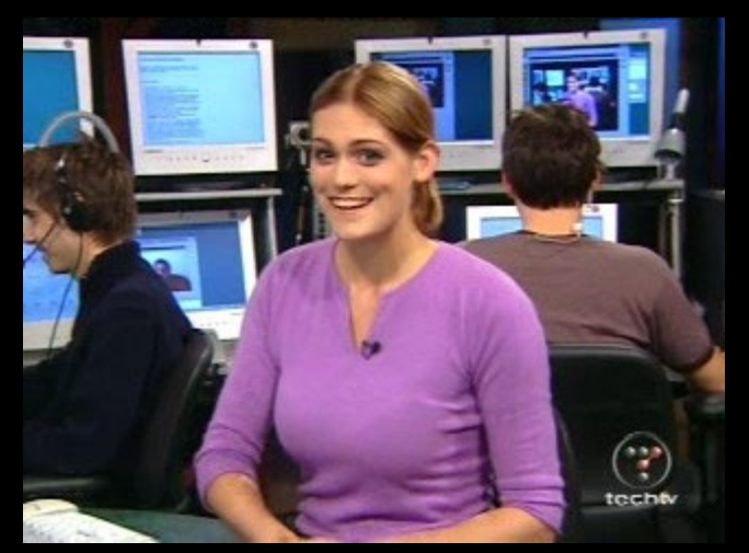
Morgan: Well, just because you're my older sister and all, it was pretty bad, god only knows where his pants went ...