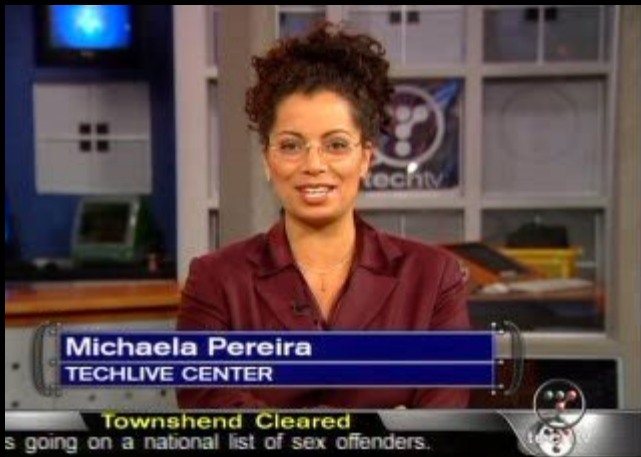
Townshend Cleared s going on a national list of sex offenders.

Michaela: This is Michaela Pereira back at the Techlive Center.