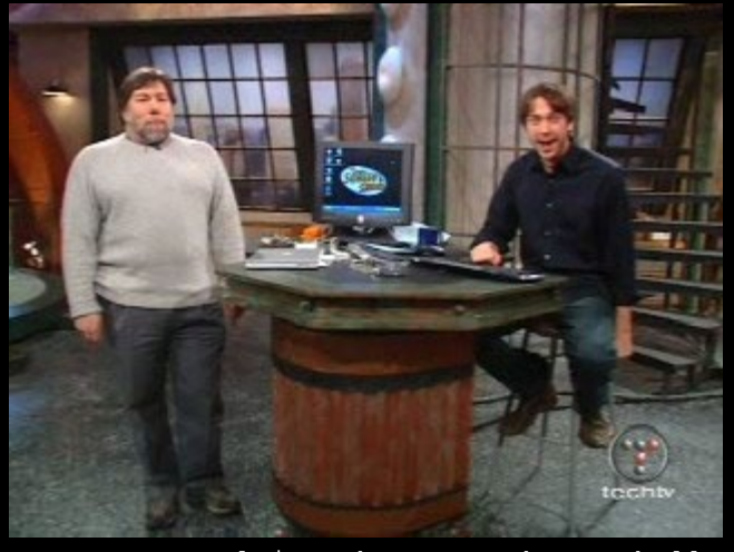
Woz: Woz proclaims that your dream shall be reality.