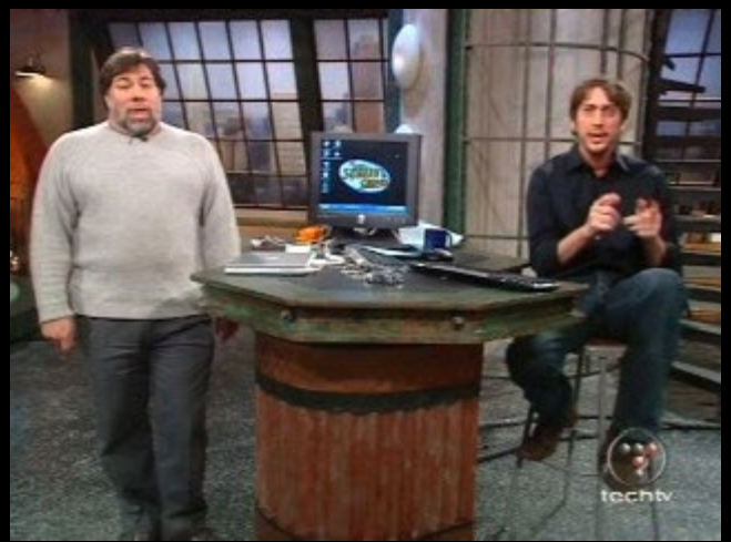
Martin: Then again, Bill Gates' ex-wives are challenging Bush's order to cancel the network. This has gone on for weeks and no one can figure out where it's going. It's a mess. Woz: Woz nods in agreement. Woz feels that Woz can fix it.