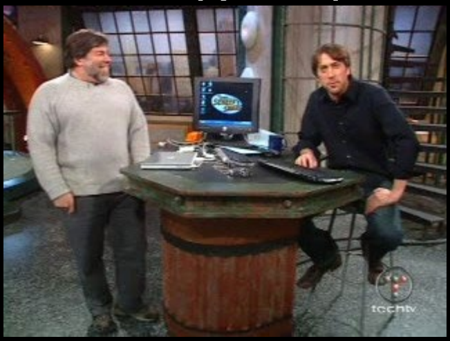
Martin: So you hated the show idea? Woz: Woz never said those words.