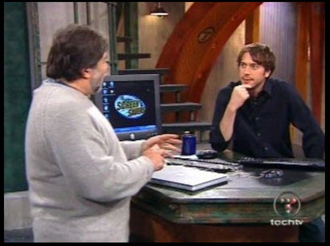
Martin: Okay, so I've been a good little boy, are you going to make my dream come true?