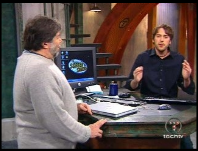
Martin: When I asked that same question to the Bush Twins, they gladly complied. Woz: Oh. That troubles Woz.