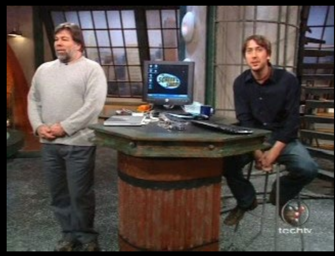
Woz: 52% Jessie-deedie! Wozzie wuzzie baddie boogie binta boo binta bee boogie down hardie slappa! Slippa slida away! Dingo-mans handy rar rar! Snaka?