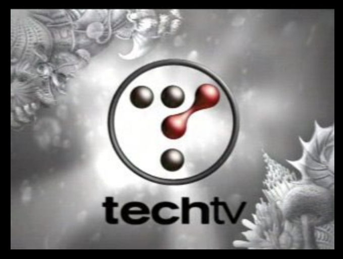
We're Caught Up! Sorta! Whoo Hoo!

Home About blog comment previous next most images (c) 2004 techtu, strips (c) 2004 james knine. Forum hosted by Amazing Forums.com