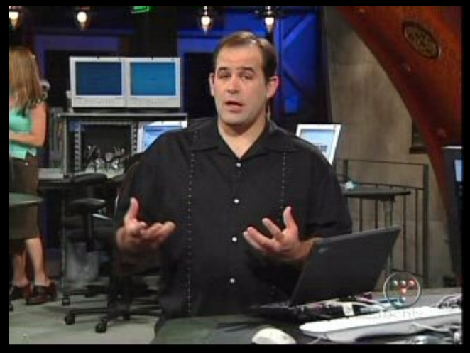
Patrick: Patrick must purge! Must get sk8rs out of head now!

Patrick: Patrick hate her! Patrick not good enough for her!