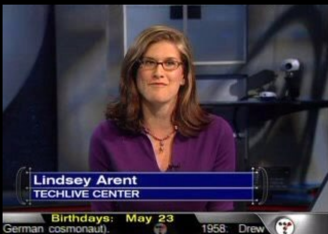
Lindsey: We thought we'd ask some of our own employees what they thought of this election. Let's go to the file footage ...