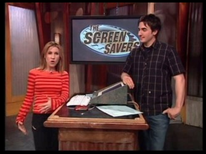
Sarah: So, what do you say? Are we tight or what?