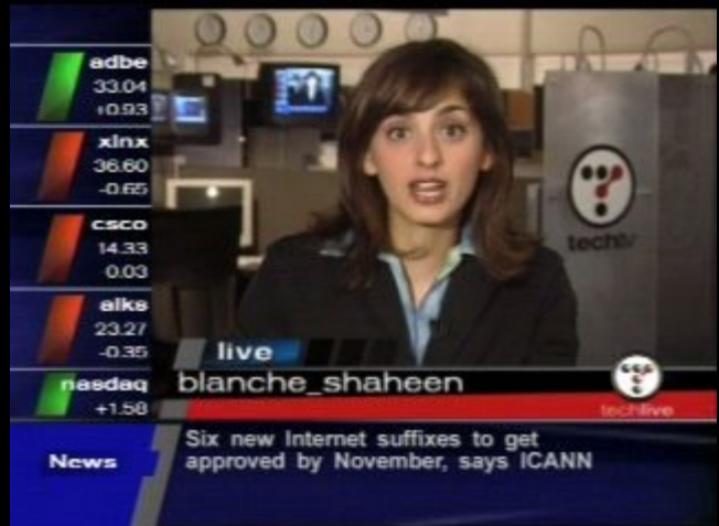
Blanche: This is the first trial conducted under the new "Protect Our Future" measure, inspired by valiant time traveler Leo Laporte, that was passed by Congress just days ago. Let's go live into the courtroom as the trial commences.