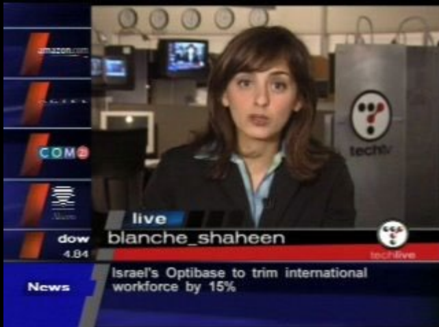
Blanche: The trial of ultra-Billionaire Bill Gates begins today. Gates is charged with the future crime of inflicting pain and suffering on hundreds of millions of computer users world-wide.