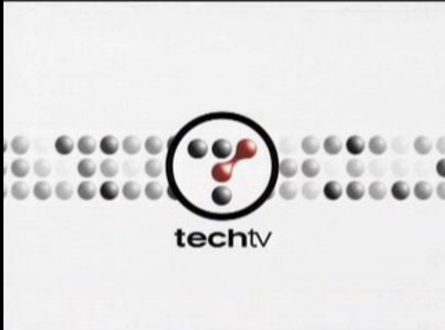
Still October 2001 ...